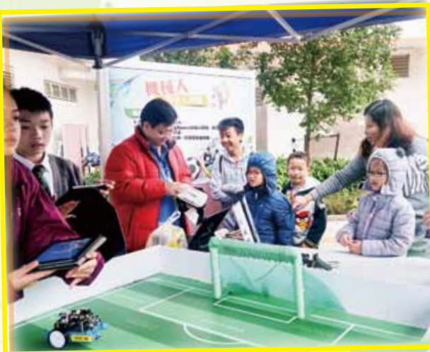
坊眾投入參與攤位活動