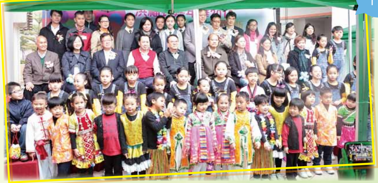
各校校監、校董、嘉賓及表演師生合影