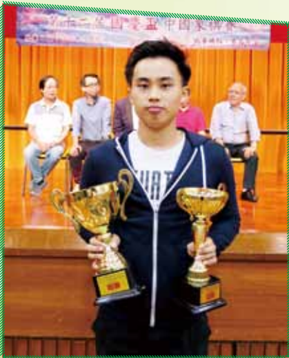
第十二屆國慶盃象棋賽 高中組 個人冠軍及高中組團體亞軍