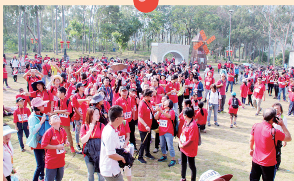
參加者人數眾多，齊聚大棠有機生態園，準備出發。